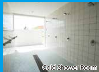
Cold Shower Room