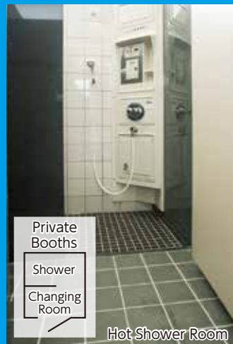
Private Booths Shower Changing Room

Management office, aid room, reception, restrooms, changing room, shower, gazebo, cooking building, beach, canoe dock, grass area, parking